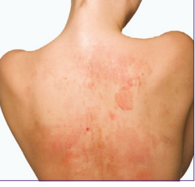
For illustrative purposes only. Individual results may vary.

*STELARA® is a 45 mg or 90 mg injection given under the skin as directed by your doctor at weeks 0, 4, and every 12 weeks thereafter. It is administered by a healthcare provider or self-injected only after proper training.